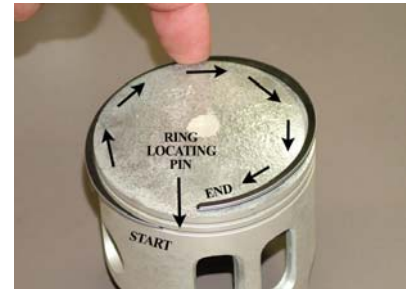
Figure 1 - Install rings