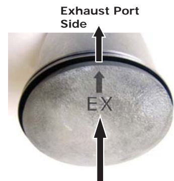
"EX" or Arrow Marking